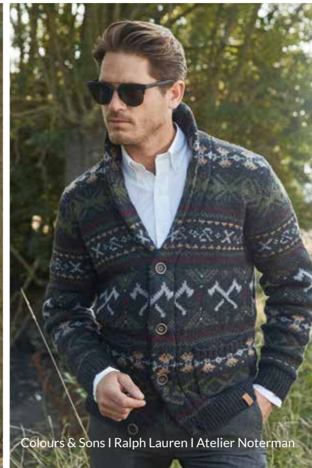
Colours & Sons | Ralph Lauren | Atelier Noterman