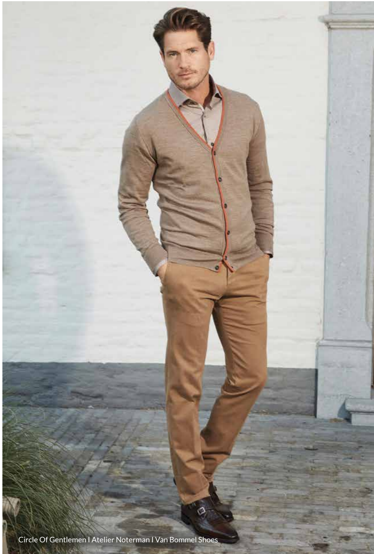
Circle Of Gentlemen | Atelier Noterman | Van Bommel Shoes