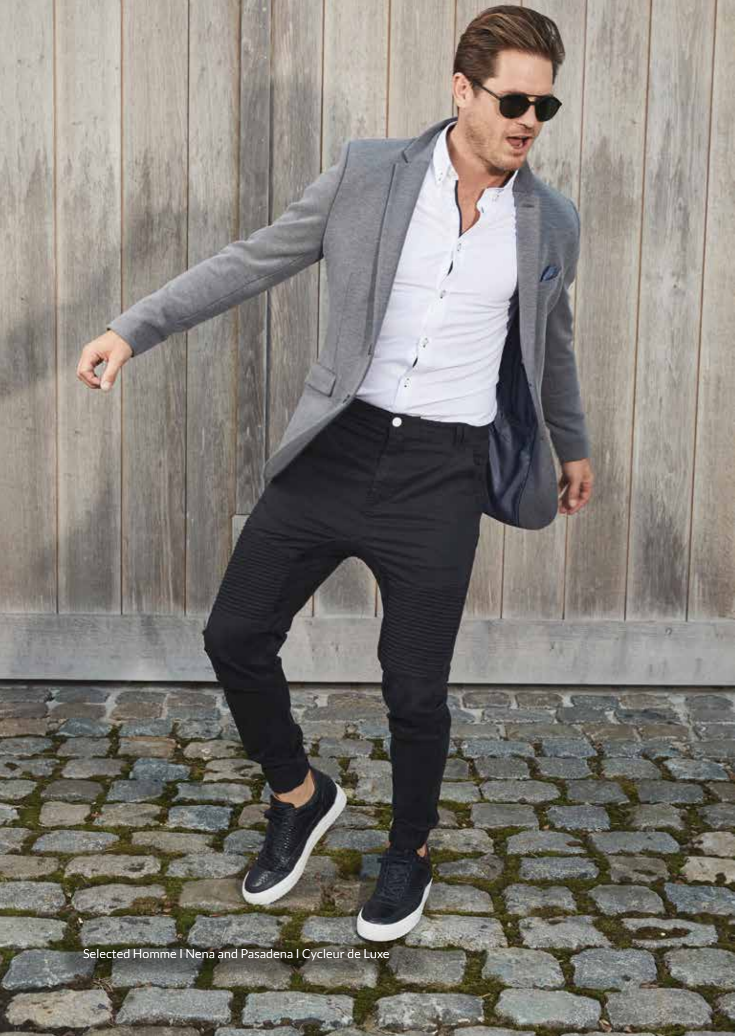
Selected Homme | Nena and Pasadena | Cyclleur de Luxe