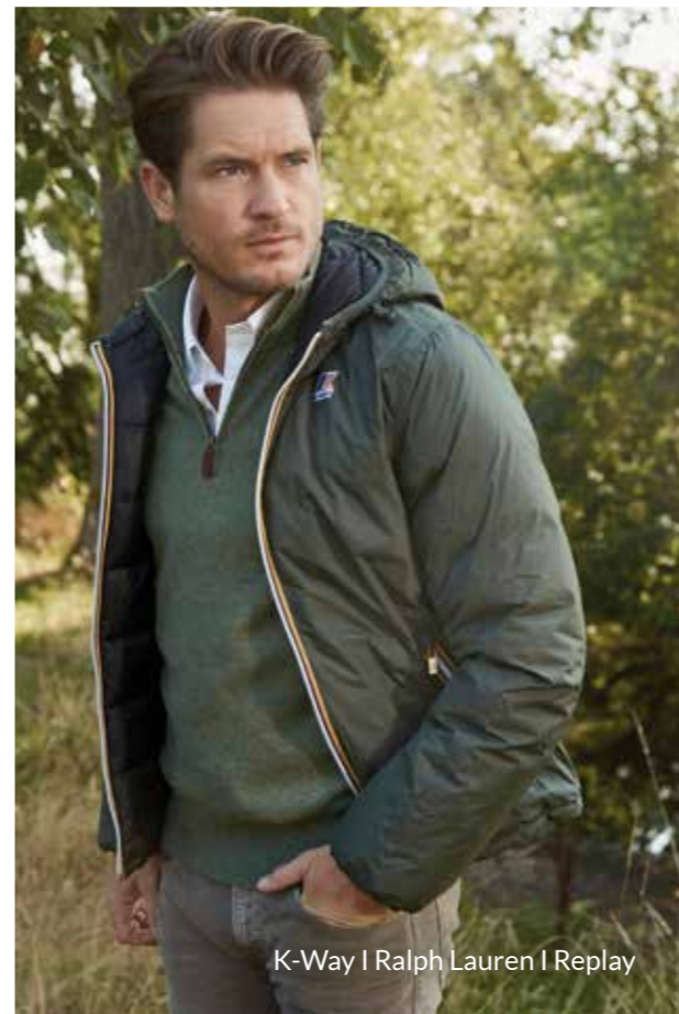
K-Way | Ralph Lauren | Replay