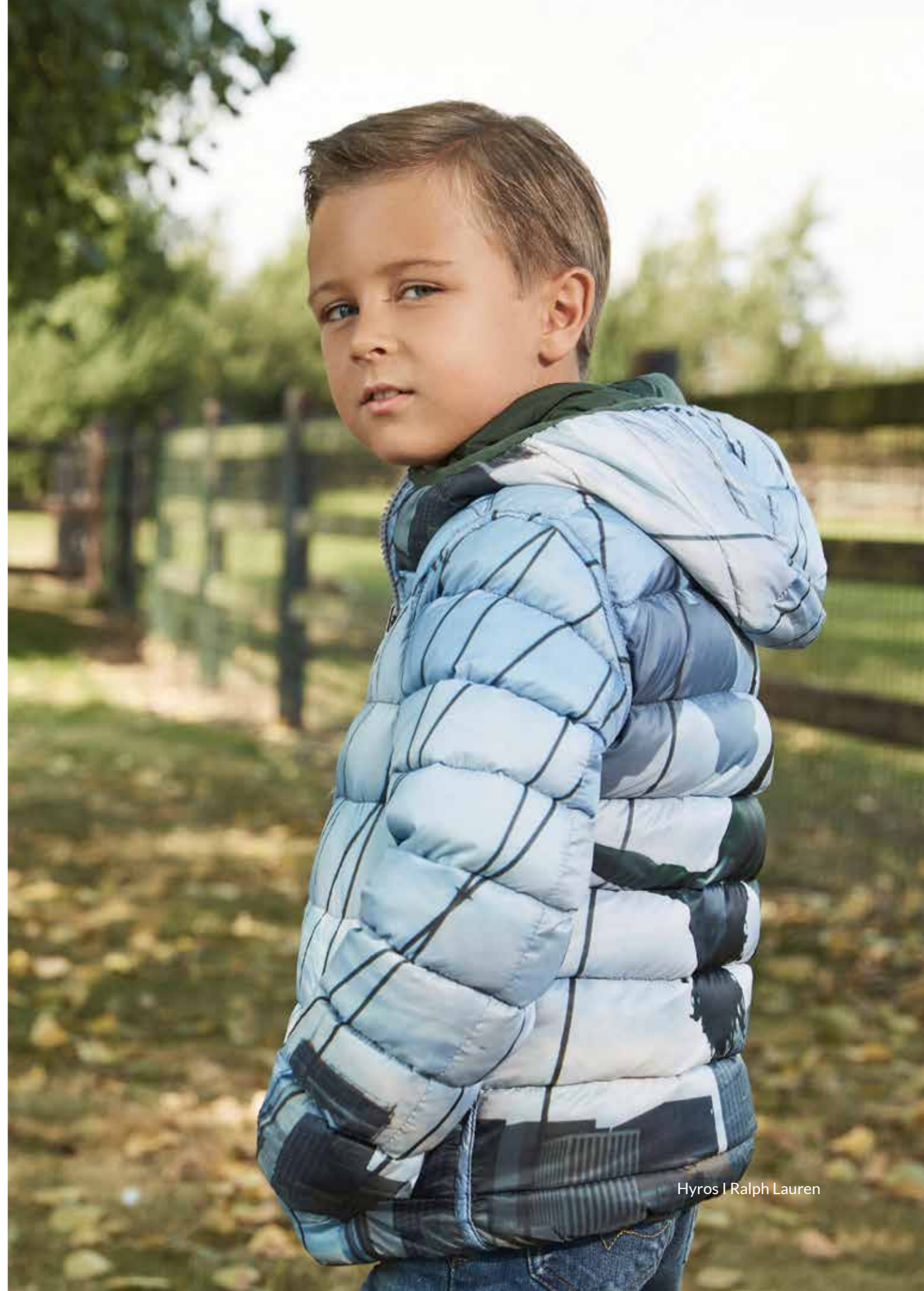
Hyros | Ralph Lauren