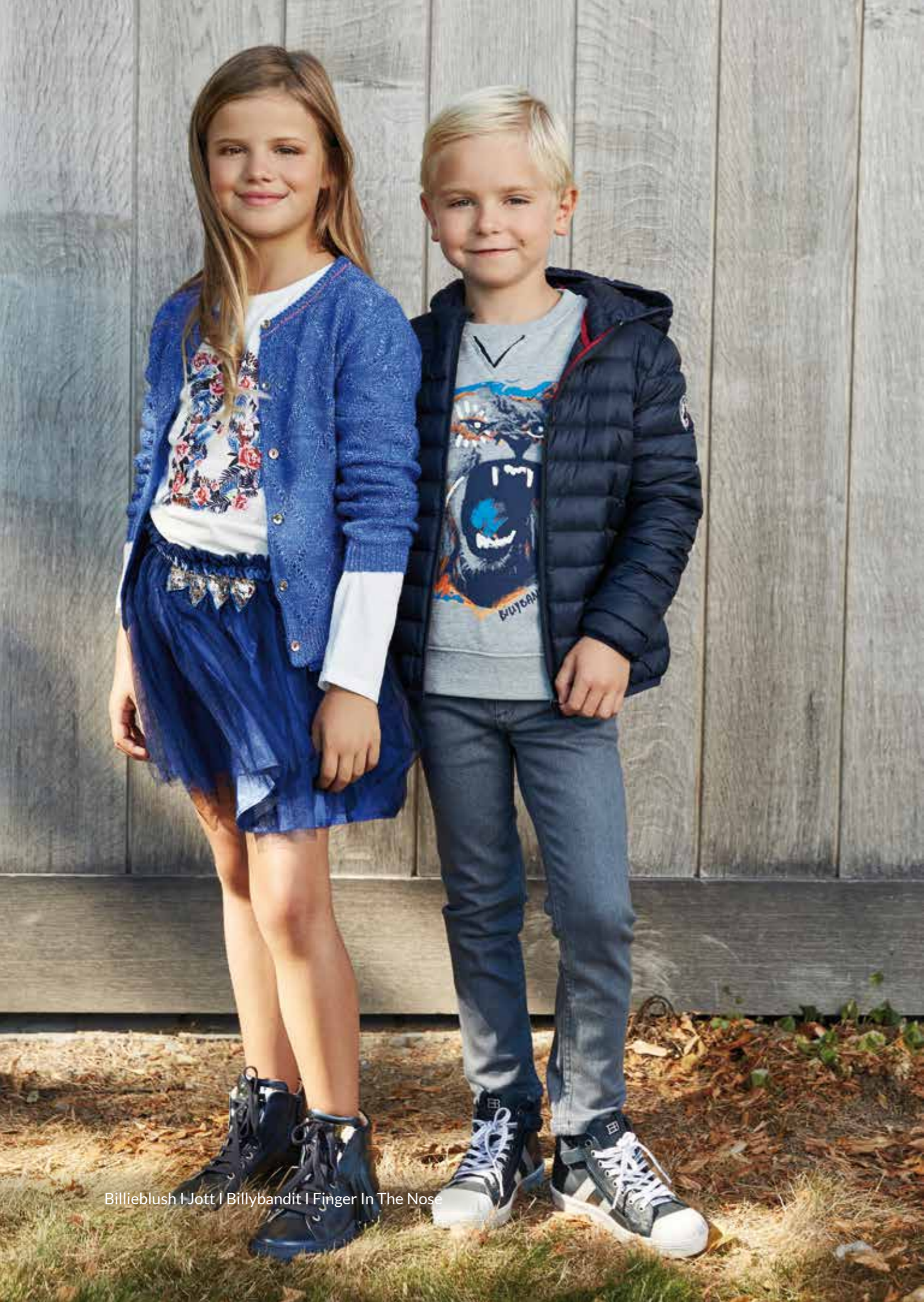
Billieblush | Jott | Billybandit | Finger In The Nose