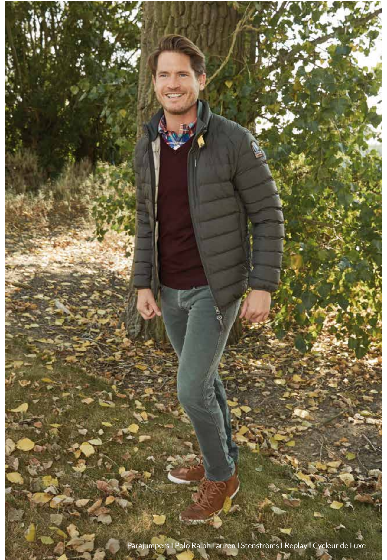
Parajumpers | Polo Ralph Lauren | Stenströms | Replay | Cycleur de Luxe