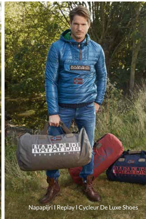
Napapijri | Replay | Cycleur De Luxe Shoes