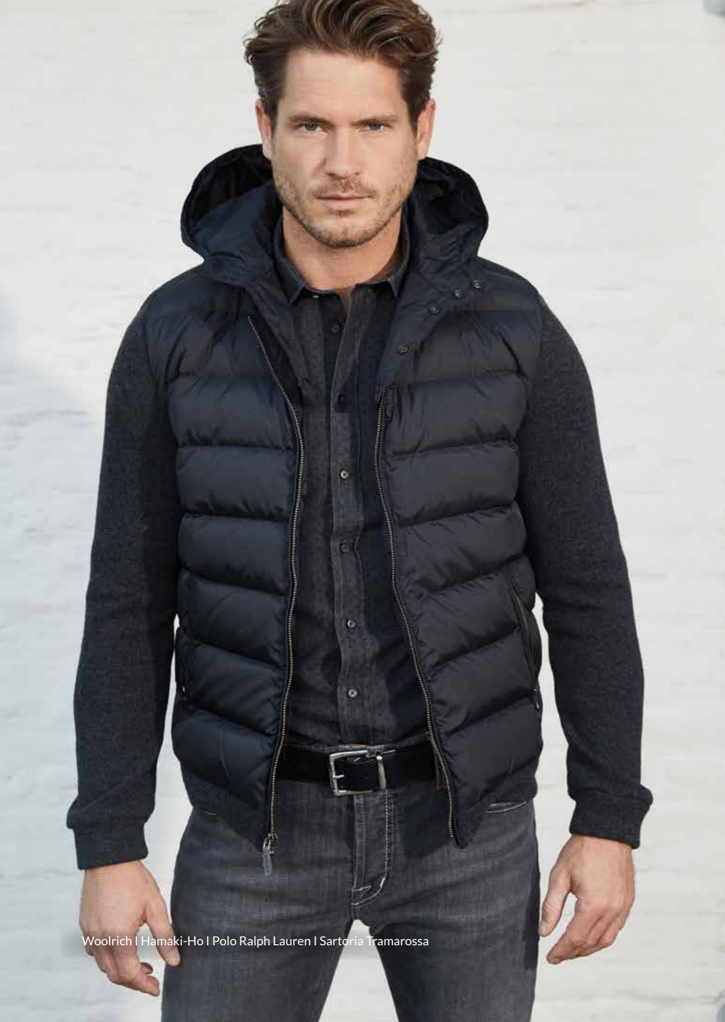
Woolrich | Hamaki-Ho | Polo Ralph Lauren | Sartoria Tramarossa