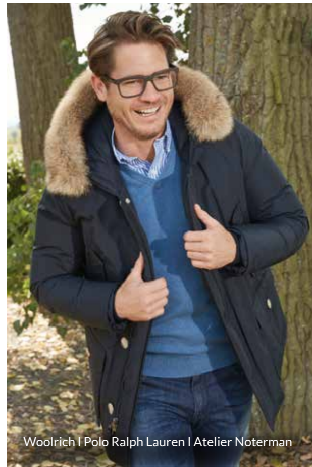
Woolrich | Polo Ralph Lauren | Atelier Noterman