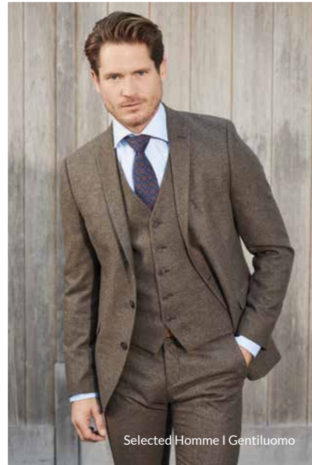
Selected Homme | Gentiluomo