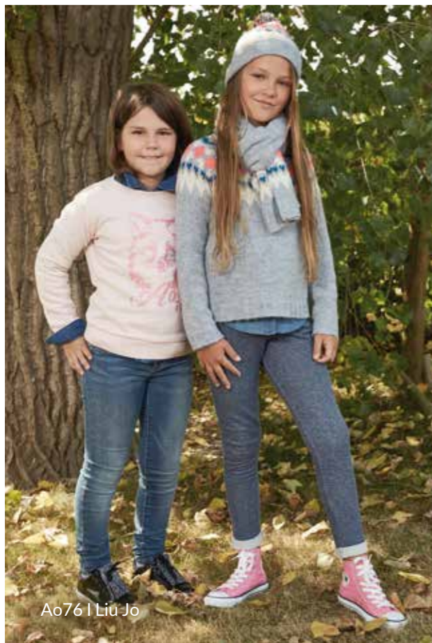
Ao76 | Liu Jo