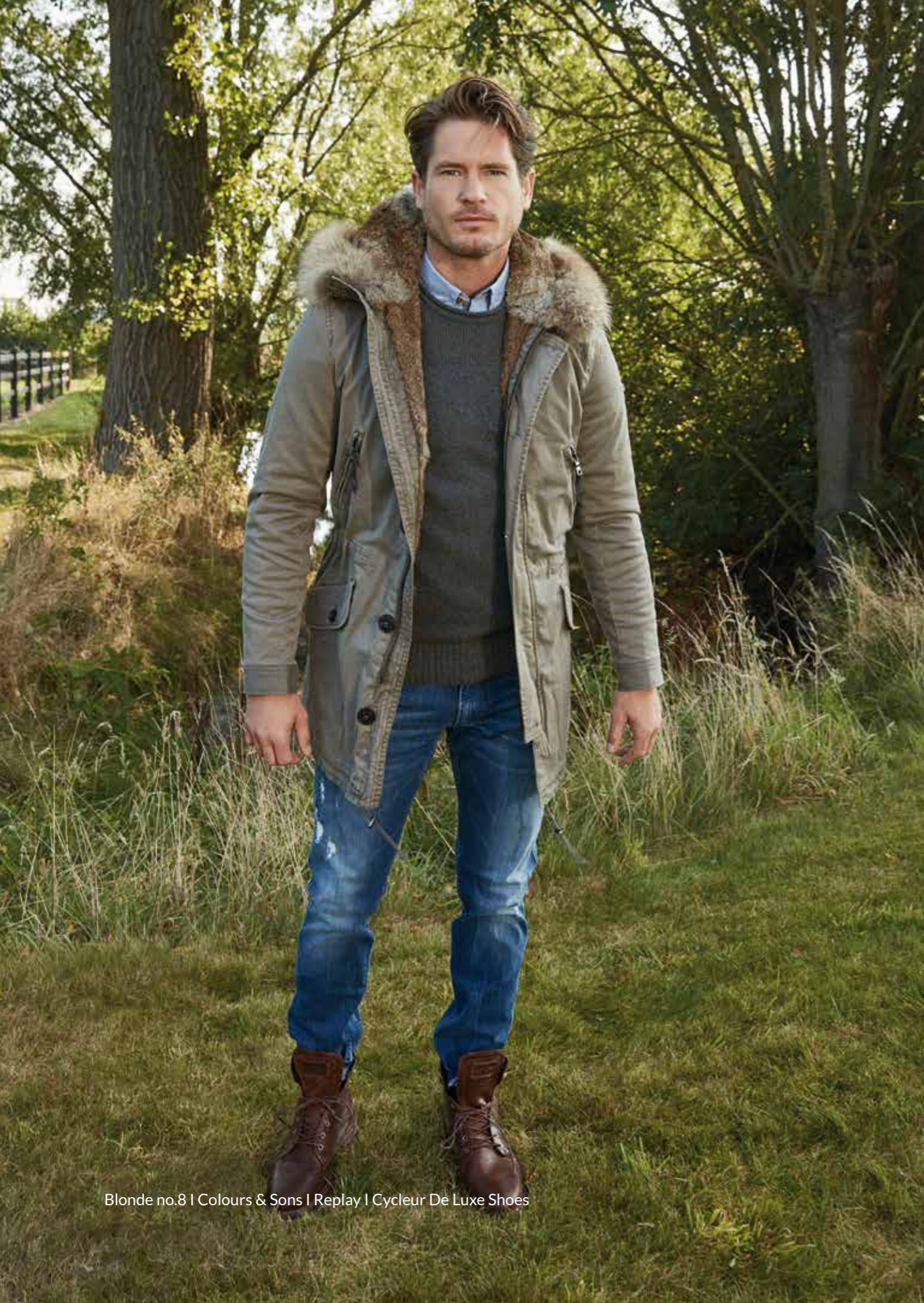
Blonde no.8 | Colours & Sons | Replay | Cycleur De Luxe Shoes