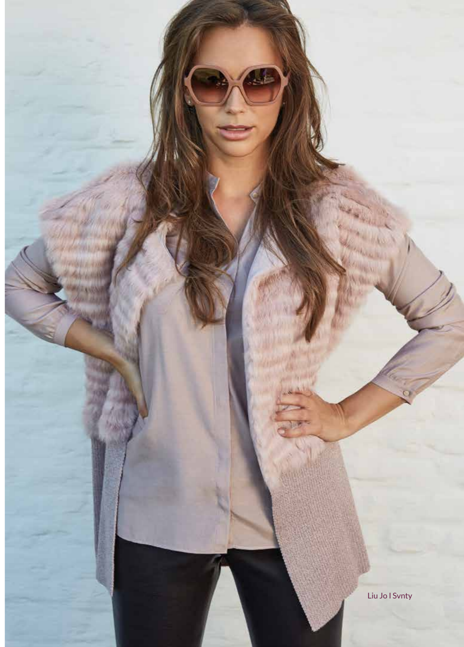
Liu Jo | Svnty