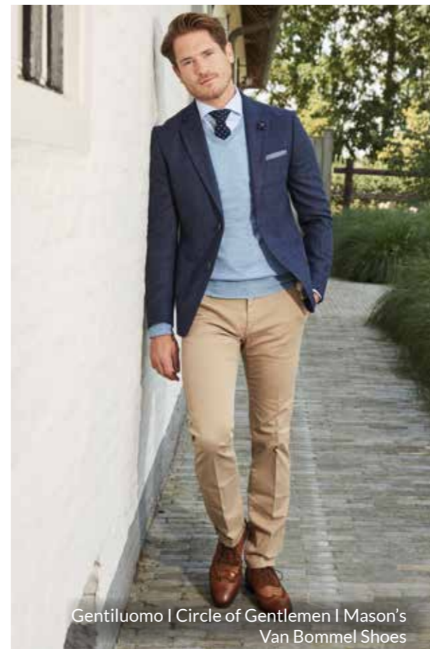
Gentiluomo | Circle of Gentlemen | Mason's Van Bommel Shoes