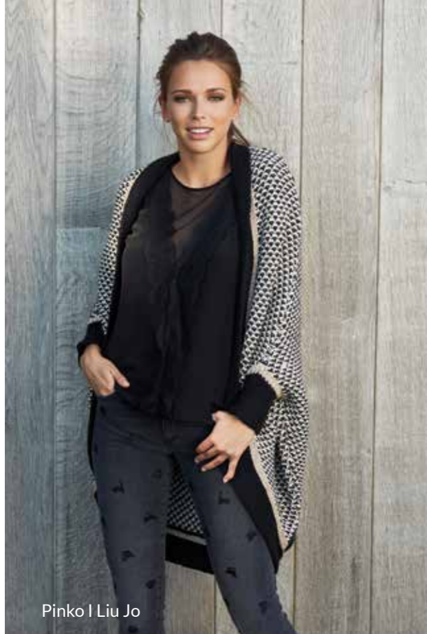
Pinko | Liu Jo