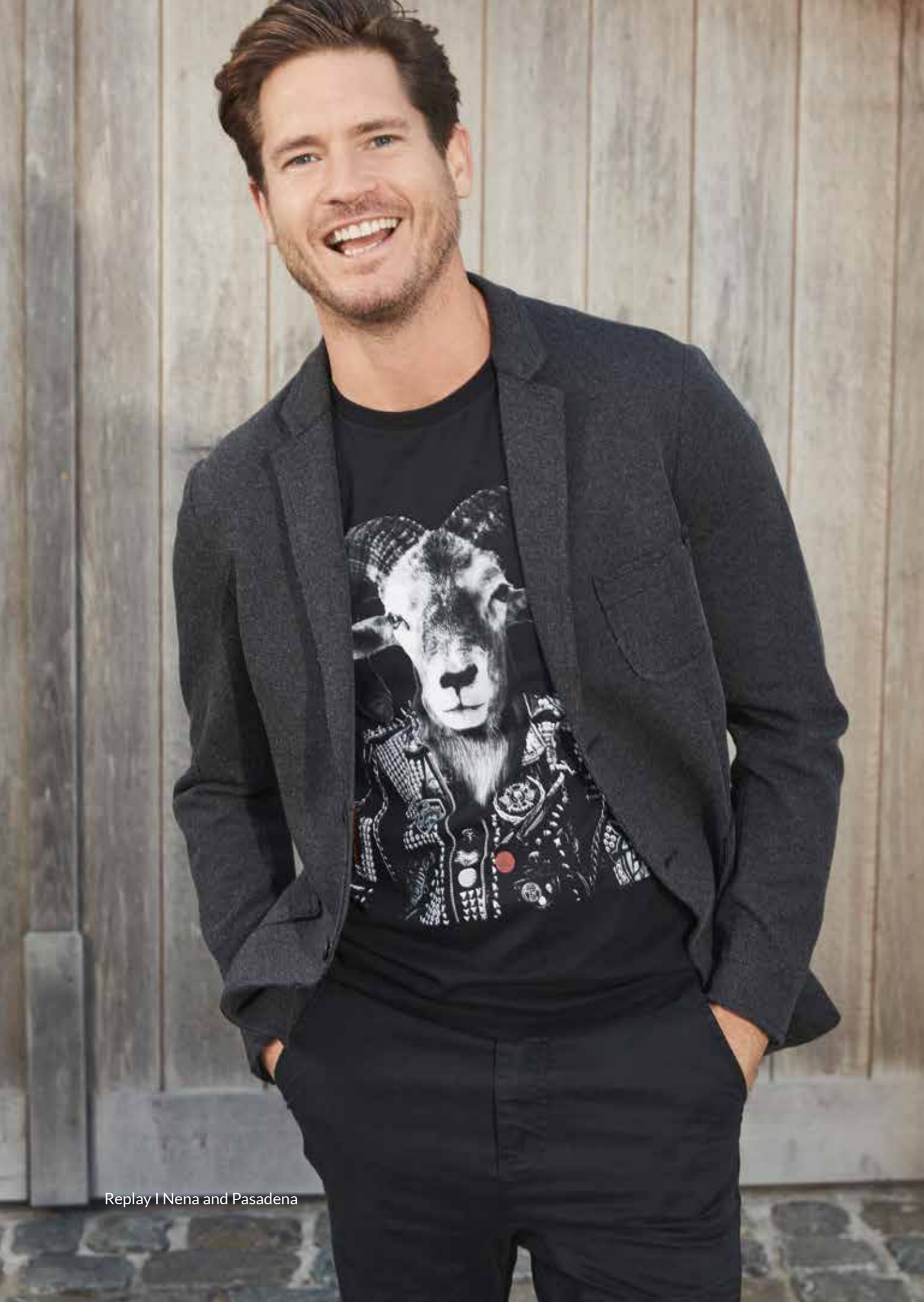
Replay | Nena and Pasadena