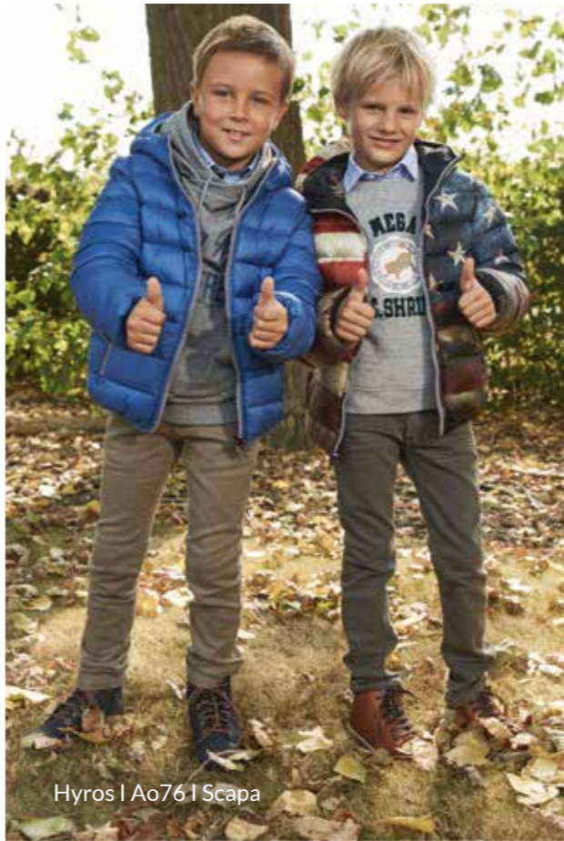
Hyros | Ao76 | Scapa