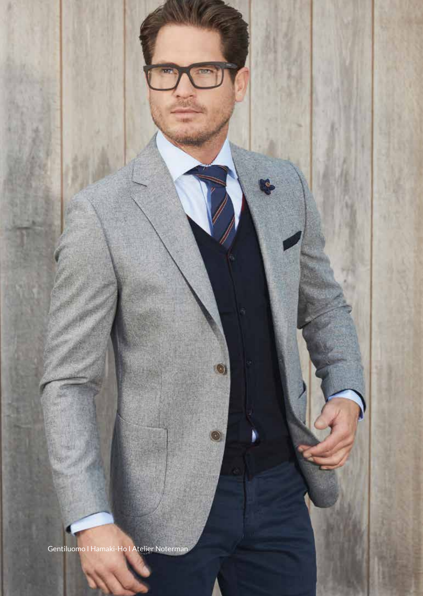
Gentiluomo | Hamaki-Ho | Atelier Noterman