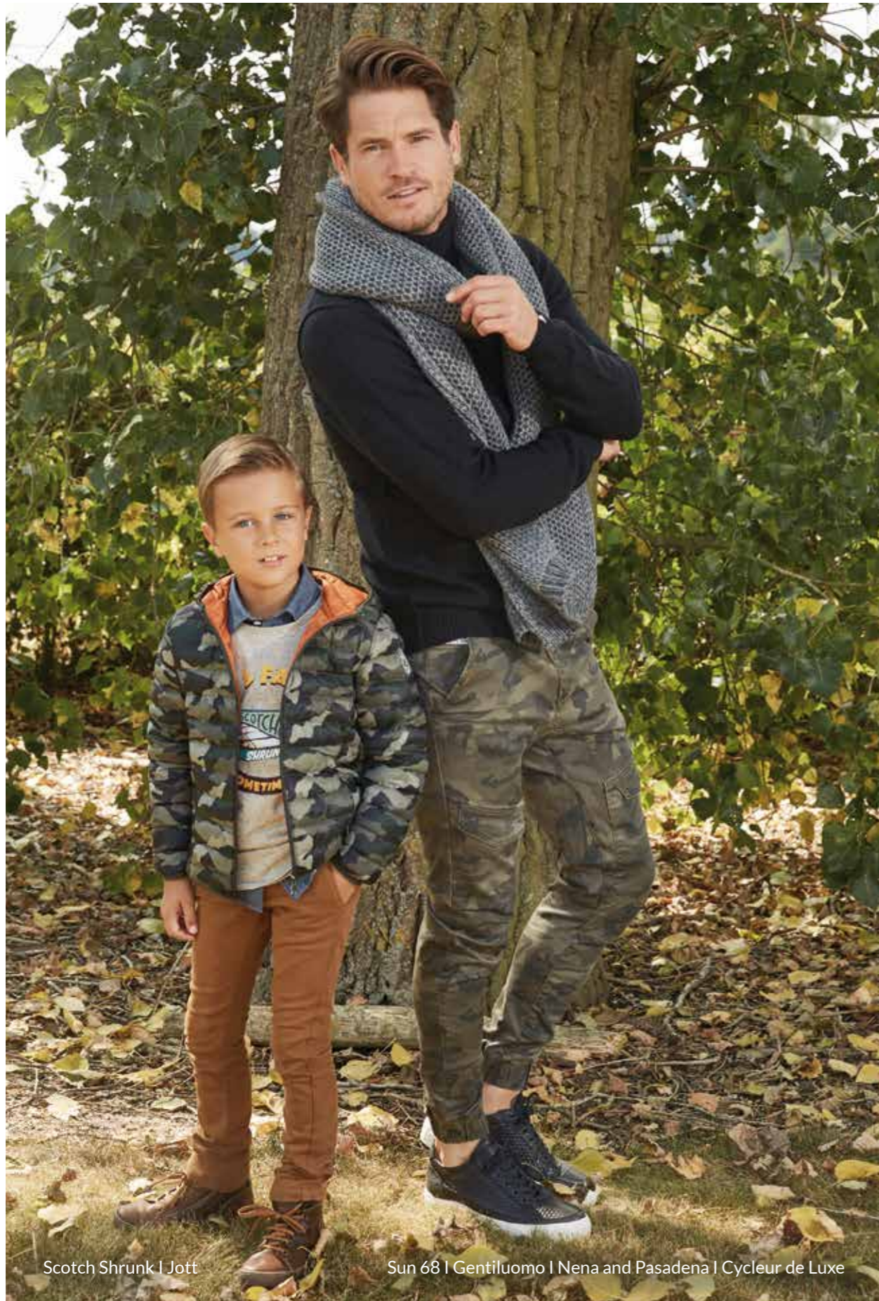
Scotch ShrunK | Jott