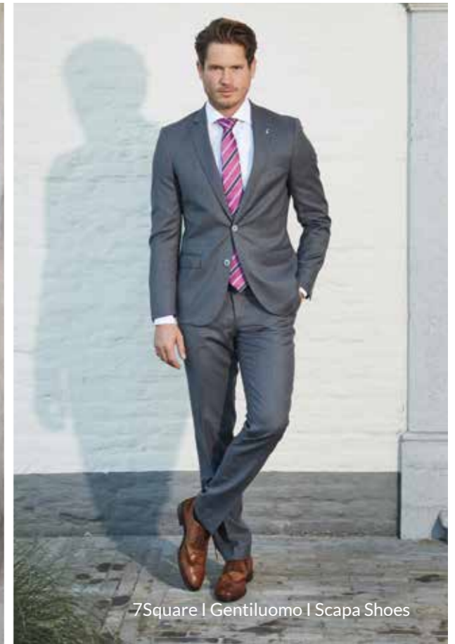
7Square | Gentiluomo | Scapa Shoes