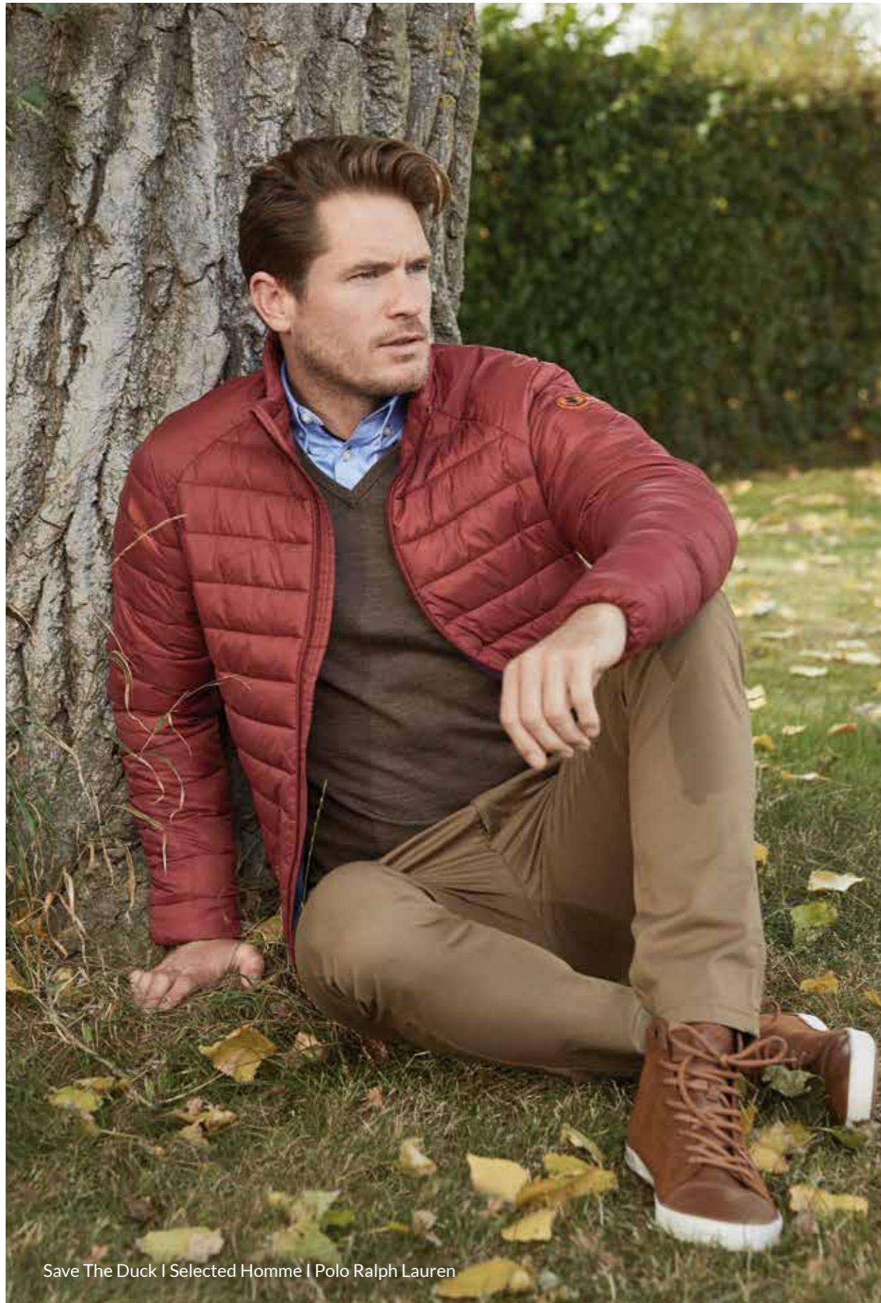
Save The Duck | Selected Homme | Polo Ralph Lauren