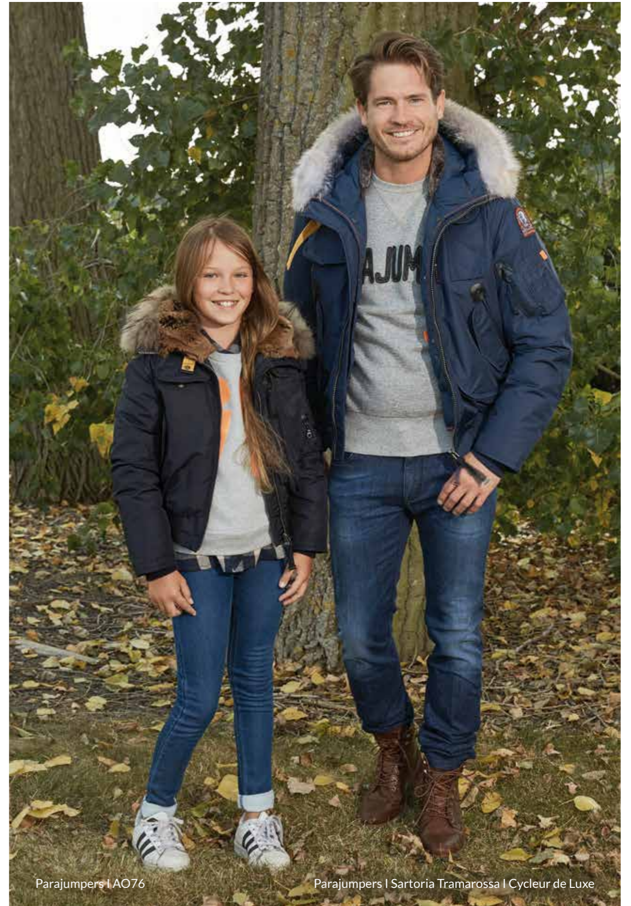
Parajumpers | AO76