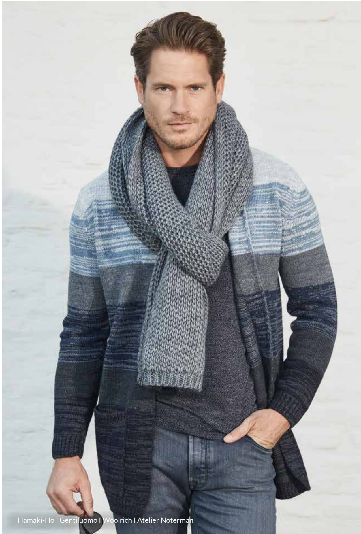
Hamaki-Ho | Gentiluomo | Woolrich | Atelier Noterman