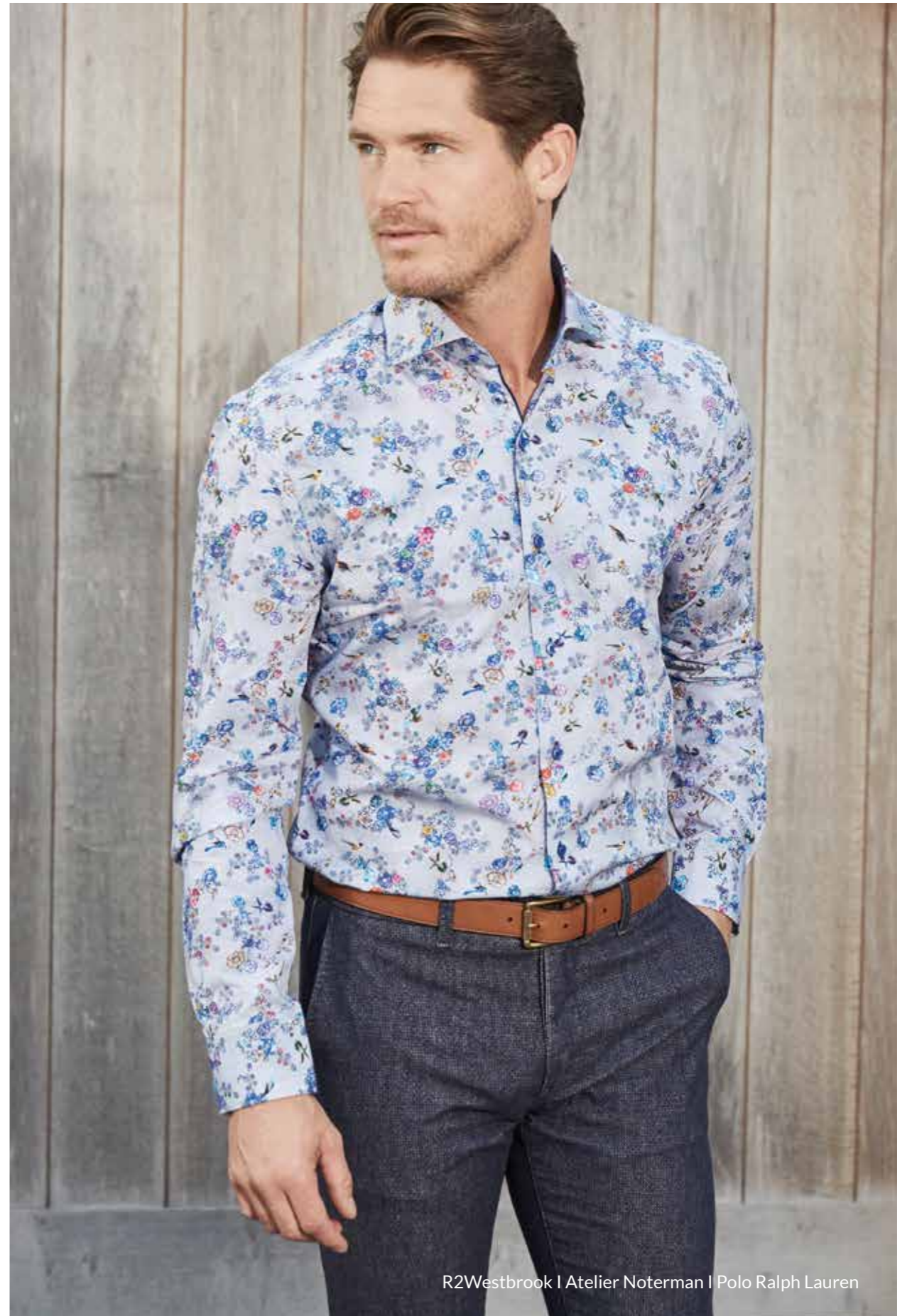
R2Westbrook | Atelier Noterman | Polo Ralph Lauren